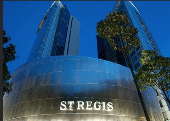
St Regis Hotel, Singapore