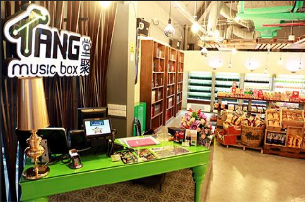
Tang Music Box