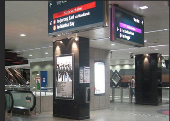
Singapore Mass Rapid Transport