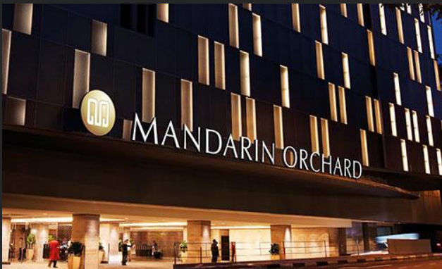
Mandarin Orchard Hotel